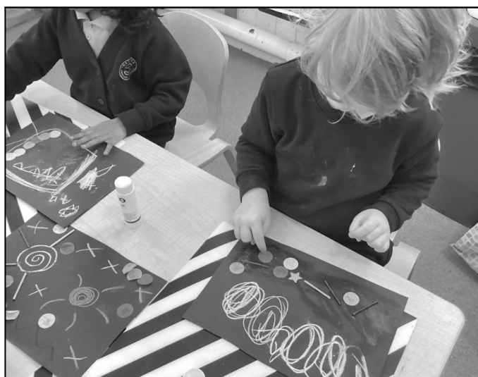
Playing, Enjoying, Growing

In both Early Years (Nursery and Reception classes) and Years 1 to 6, children's learning is arranged enabling our learners to experience a broad and balanced experience with deepening progression in the six Areas of Learning and Experience-Language, Literacy and Communication, Mathematics and Numeracy, Science and Technology, Health and Wellbeing, Humanities and Expressive Arts.