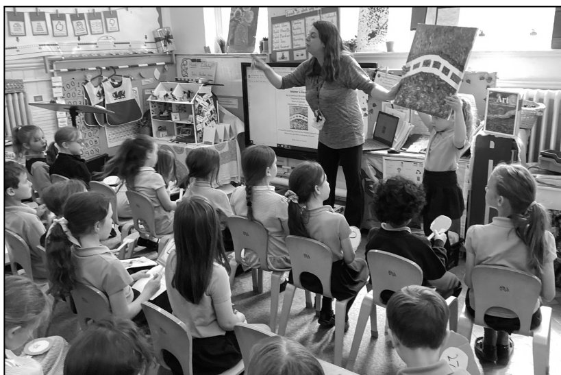
Engaging, applying, collaborating - placing bids at our Art Auction

We want our pupils to understand and enjoy Mathematics. Each class incorporates rich 'reasoning' and problem-solving experiences into our Mathematics teaching and learning. Teaching our children to systematically work out, justify their thinking, use the appropriate strategy, learn from mistakes and explain their working. There is an emphasis on appropriate skills teaching of number, geometry and algebra and then opportunities for the pupils to use and apply these proficiencies with fluency in engaging contexts and open-ended problems and use Mathematics effectively across our curriculum.