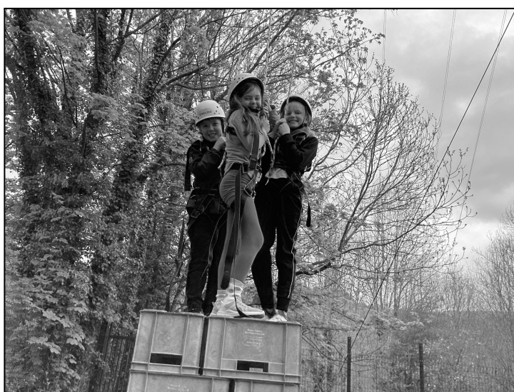
The sky's the limit at Gilwern!

There were two residential visits this year. Our Y3-6 learners visited Gilwern in the summer and our Y5 learners visited Urdd in Cardiff. These visits are always much-enjoyed and offer our learners the opportunity to explore, learn and discover with their peers in a different environment.