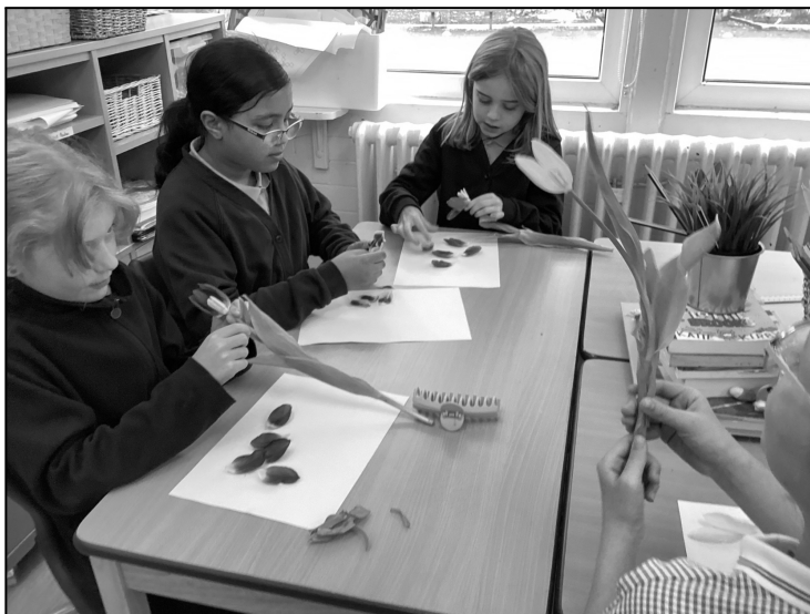
Curiosity at Clytha

problem-solving and collaborative learning with rich opportunities to extend these skills across the curriculum.