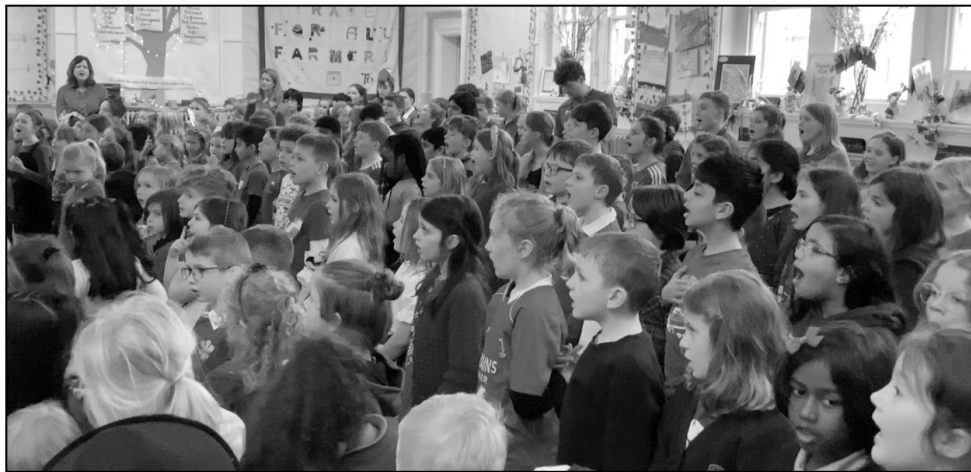
Celebrating our Welsh heritage and culture at our Eisteddfod 2024

The Clytha Bard was crowned with her majestic and magnificent poem and House Captains rallied their Clytha Houses. World Book Day, ClythAY Reading Festival, Picnic yn y Playground, Winter Fayre and Summer Fayre all supported the importance of 'Clytha Familyness'