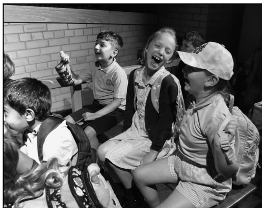
Engaged learners, where learning is a joy!

Several policies were reviewed in 2023-2024. These included Clytha's Anti-Bullying and Behaviour Policies, Child Protection and Safeguarding Policies, School Security, Attendance and Admissions Policies, Additional Learning Needs Policy, Progression and Assessment and Complaints Policy.