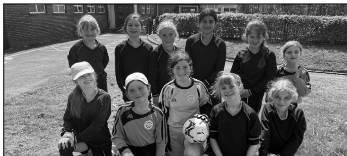
Healthy, happy and growing in confidence

We continue to teach our learners emotional literacy, social- and lifelong skills, RSE and resilience in an age-appropriate manner, equipping our children for happier and healthier lives, giving them agency to make their way through the world following all Welsh Government guidance and regulations.