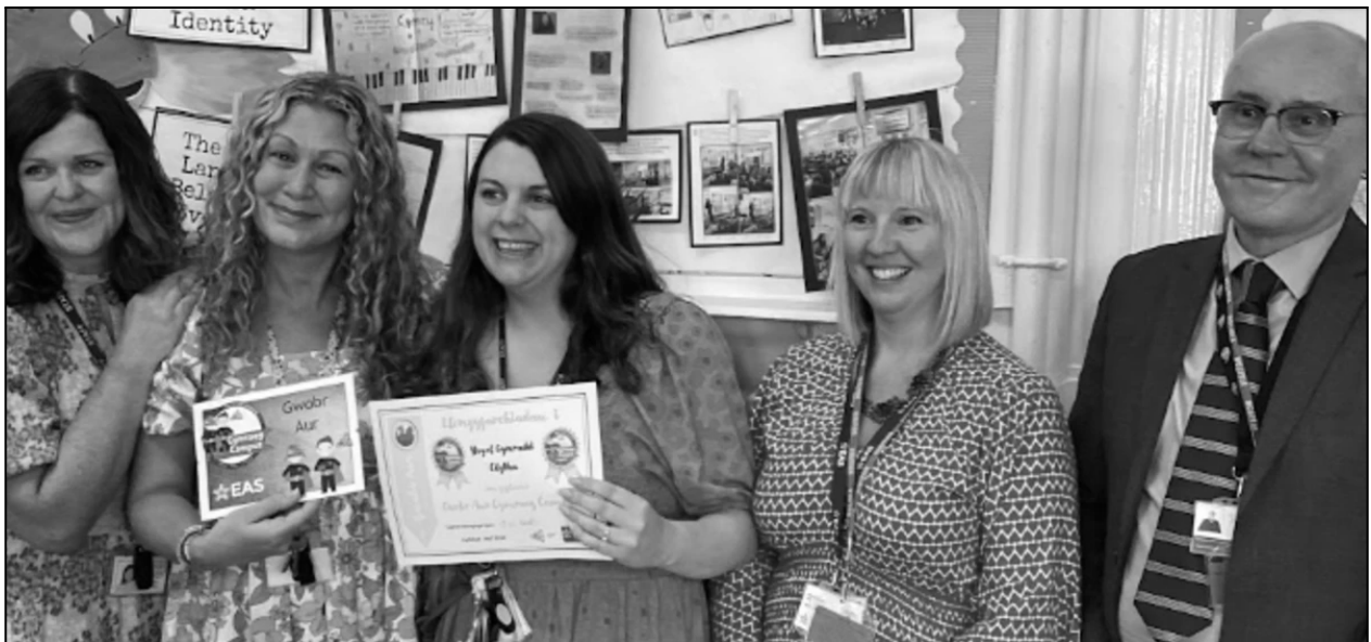
Achieving GOLD in recognition of our work to promote, use and develop Welsh language skills

Clytha enjoyed a very successful 'Languages Week' where the home languages of our children were celebrated. Clytha achieved the gold Cymraeg Campus Award recognising the hard work of staff and learners to promote, use and develop Welsh language skills. Clytha is the first English-Medium school in South-East Wales to have achieved this.