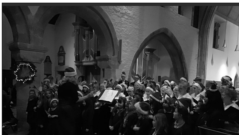
Celebrating in song at the Cathedral

Whole-School and Clytha Community events such as our Autumn Show and Harvest were still celebrated, Sports Week and Sports Day were shared with families. Christmas Concerts took place in our School Hall and at St John's Church and carols were sung at the Cathedral by our school choir. Our Eisteddfod was a wonderful event, with music, song, celebration and a genuine sense of togetherness.