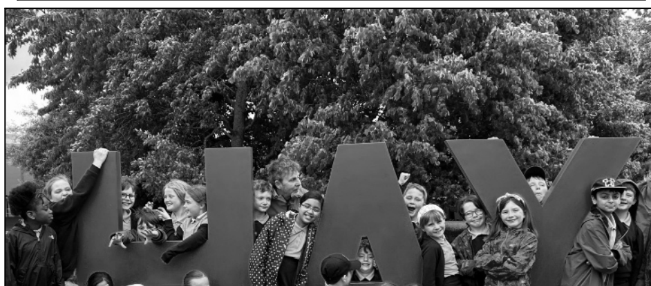
Inspirational people and visits to ignite a passion for learning

Whole-School and Clytha Community events such as our Autumn Show and Harvest were still celebrated, Sports Week and Sports Day were shared with families. Christmas Concerts took place in our School Hall and at St John's Church and carols were sung at the Cathedral by our school choir. Our Eisteddfod was a wonderful event, with music, song, celebration and a genuine sense of togetherness.