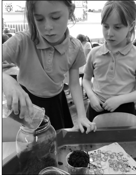
Discovering and developing at Clytha

'To share with and inspire all with our passion for teaching and learning. Igniting a love of learning in all and influencing and empowering others to create and develop environments and opportunities where learning is a joy and it is a joy to engage.'