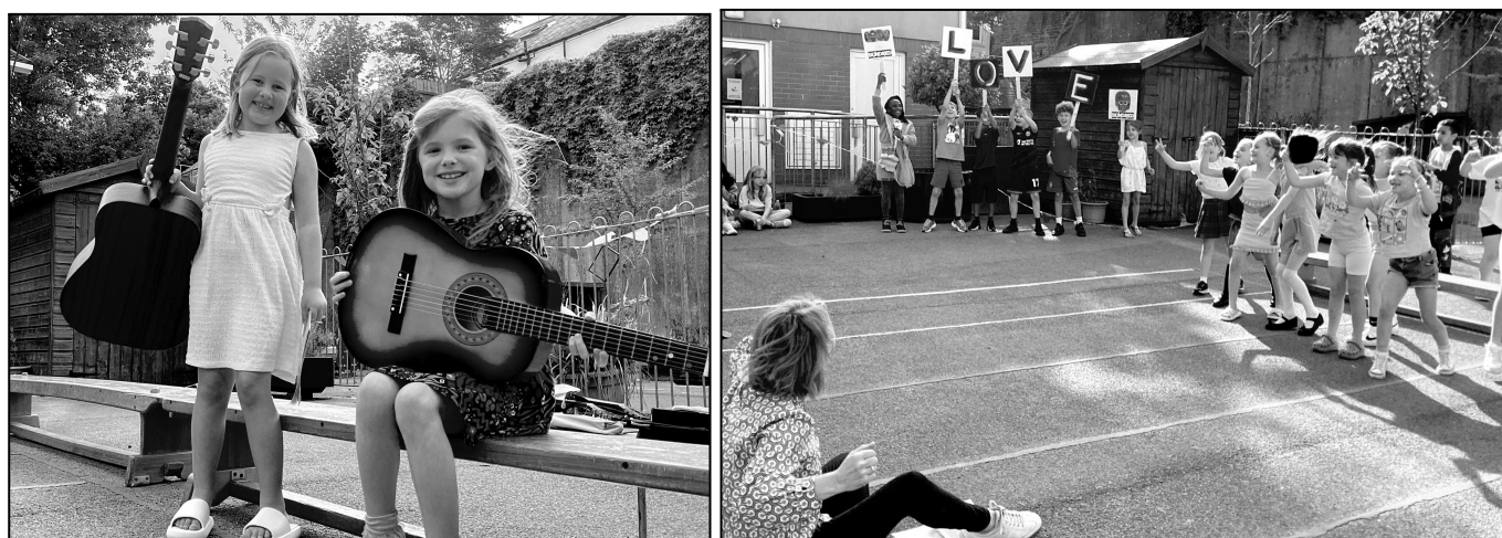
Creating, performing and entertaining with confidence at Clytha

We encourage our Clytha children to develop holistically at Clytha and as a Governing Body, we support the promotion of musical opportunities as part of our Expressive Arts Curriculum and with Gwent Music peripatetic Teachers. We celebrated a wonderful evening of music, drama, art and song enjoying the talents of our learners in our 'Picnic yn y Playground' in the summer.