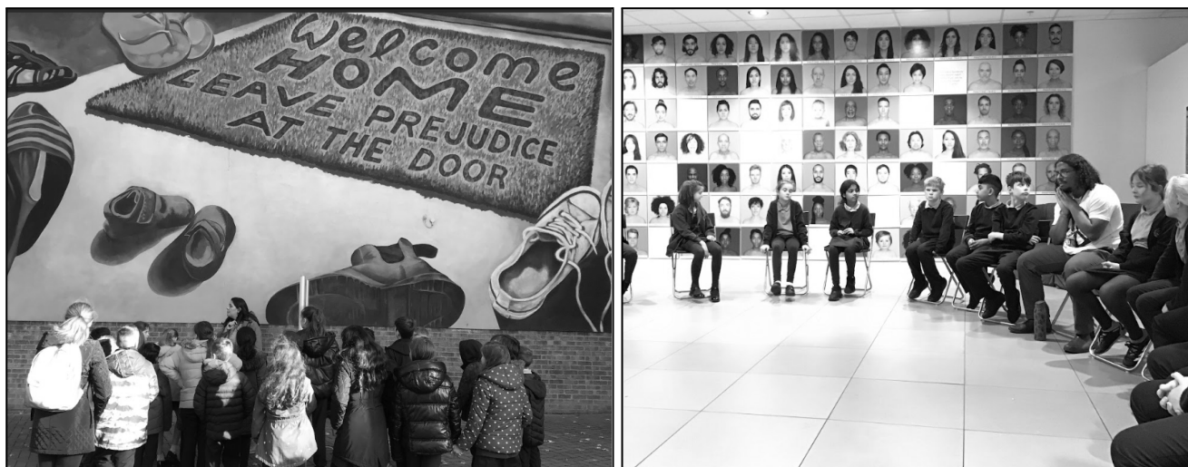
Exploring and informing minds at the Migration Museum, London

We continued to develop our understanding and respect for our wonderfully diverse Clytha Family and world throughout the year including staff building on our existing approach with Diversity and Anti-Racism Professional Learning. This will remain a priority for next year as we construct our Anti-Racist Principles and continue our work to decolonise our curriculum and celebrate our wonderfully diverse Clytha Family and community going forward.