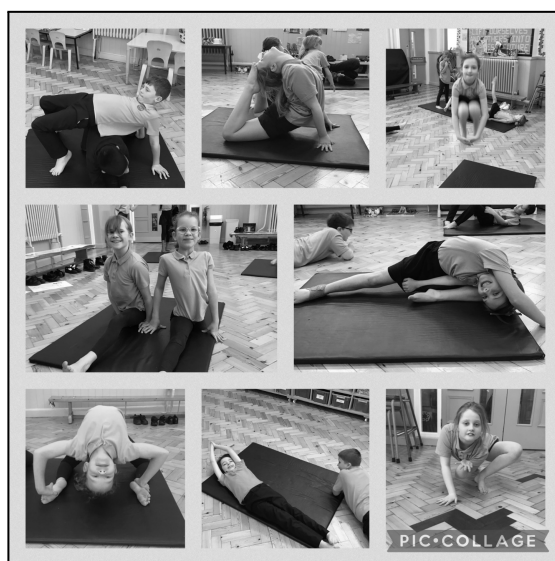
Strengthening our learners to their very core!

Our Clytha children also benefited from active outdoors sessions and learning more about healthy lifestyle choices. Classes throughout the year prioritised exercise and the positive impact it has on wellbeing. All classes completed weekly physical sessions developing important core strength through gymnastics skills and dance. Our Forest School area has been revamped to allow our learners to grow vegetables next year, just as our Nursery learners do.