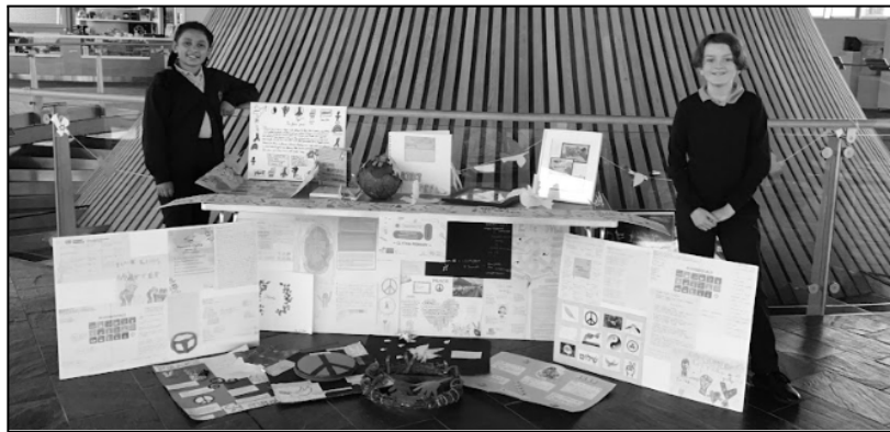
Ambassadors for Clytha, promoting our whole school focus of 'Project Peace' at the Senedd

The development of our approach towards the Wellbeing of all -physically, emotionally and mentally has been a continuing focus in our Development Plan this year. Clytha has continued to use a range of successful strategies being embedded and shared throughout the school including Zones of Regulation which is an approach that helps our learners to develop self-regulation strategies. Mindfulness, breathwork and developing resilience and learning strategies helped our Clytha learners to make progress and feel safe and happy in school. Learner Groups have flourished at Clytha this year with our School Senedd leading with Action Plans leading to progress. Ministers presented to Governors and have led assemblies for the school. Their voices are listened to and valued.