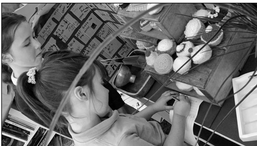
Irresistible and authentic role play areas to engage our learners

We want our pupils to understand and enjoy Mathematics. Each class incorporates rich 'reasoning' and problem-solving experiences into our Mathematics teaching and learning. Teaching our children to systematically work out, justify their thinking, use the appropriate strategy, learn from mistakes and explain their working. There is an emphasis on appropriate skills teaching of number, geometry and algebra and then opportunities for the pupils to use and apply these proficiencies with fluency in engaging contexts and open-ended problems and use Mathematics effectively across our curriculum.