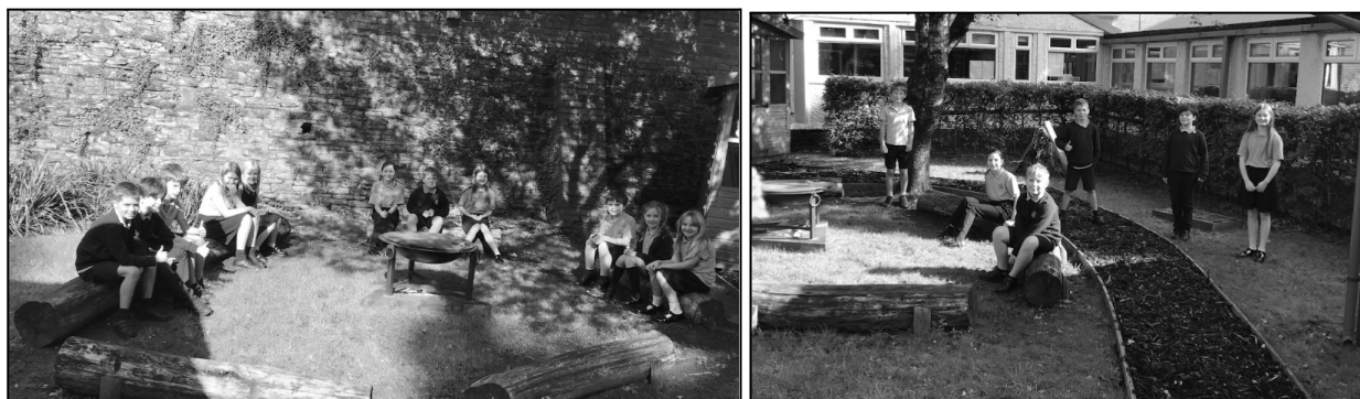
Outdoors, Indoors, Literate and Learning