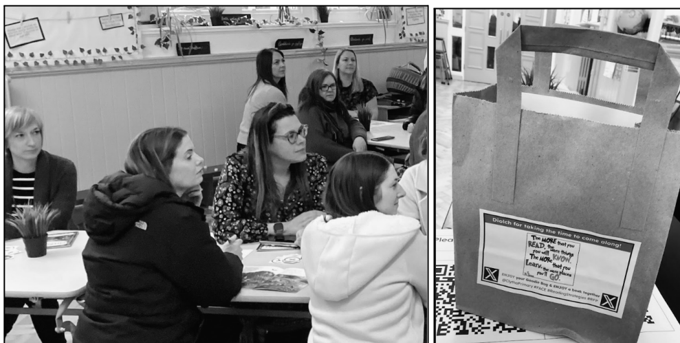
Family Engagement flourishing at Clytha, supporting families to support learners

Our Clytha Families responded to our FoodBank Collections throughout the year and to days such as Red Nose Day and supported us with our Family Engagement sessions on Reading and Online Safety.